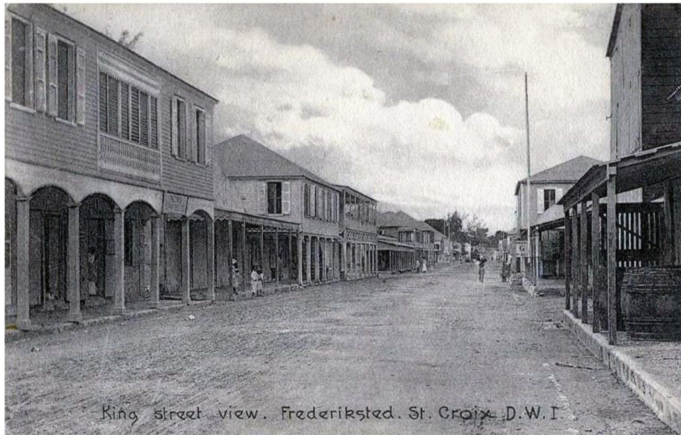
King street view. Frederiksted. St. Croix D.W.I.

Over time, communities build structures to address their physical, social, and cultural needs. They build homes, and schools and churches. They build roads and streets that connect them. They build places to work and to enjoy themselves and they build places to bury their dead.