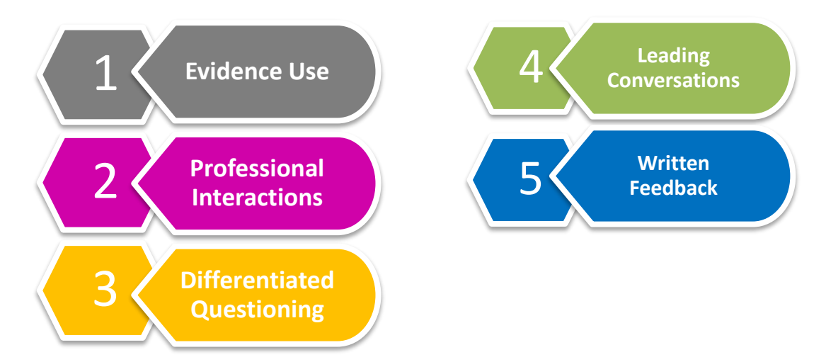
Figure 3. Behavioral Indicators for Instructional Feedback

The rubric uses a four-point scale to score principals: