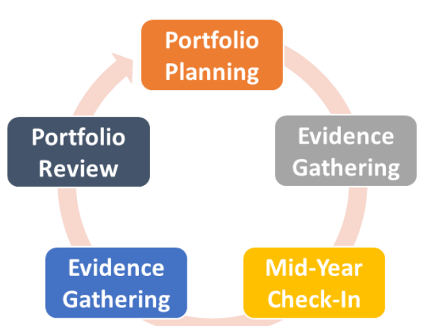
Figure 1: Assistant Principal Portfolio Process

The Assistant Principal Portfolio process is similar to the Principal Portfolio process in many ways. The Assistant Principal Portfolio process encourages collaboration with the principal and reflection. Each assistant principal engages in planning, collecting artifacts and sharing a portfolio to demonstrate exemplary performance on all five practices in the AP Framework.